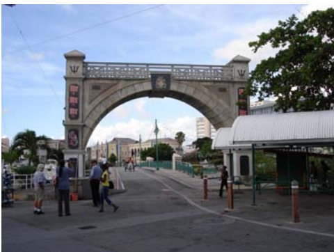
Independence Arch, Bridgetown