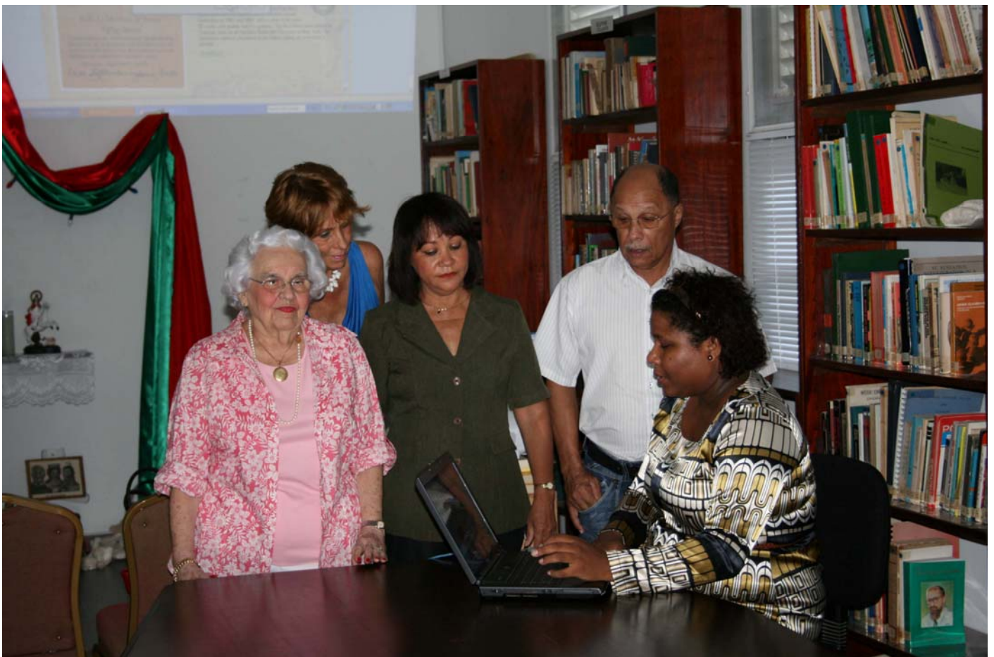
First participants in the Cultural Heritage Website

This website was designed by Kuki & Co. and is made possible with the financial support of the Mondriaan Foundation, in the Netherlands.