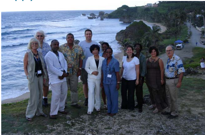
The MAC Board and some MAC members at Bathsheba during a tour of Barbados, December 3 rd 2009, following the AGM Meeting

The Museums Association of the Caribbean Board wishes all its members and fellow museum colleagues a Happy New Year.