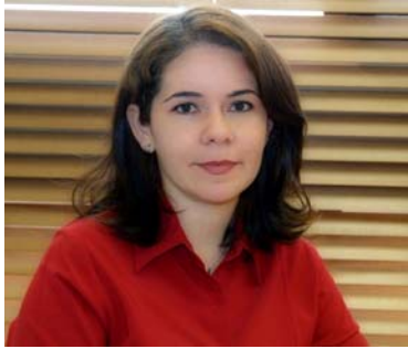
Centro Cultural Eduardo León Jimenes (Dominican Republic). s.arias@centroleon.org.do