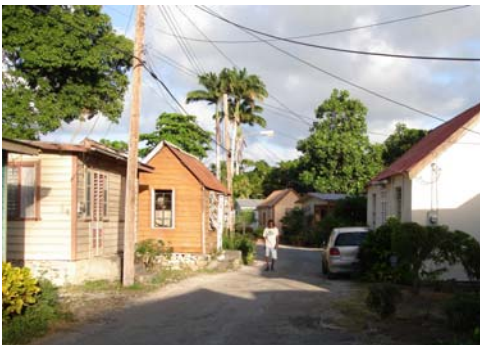
Street scene in Speightstown