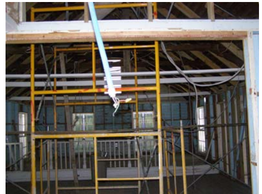
2007- Reinforcement work in the Old Courts Building, Cultural History Gallery