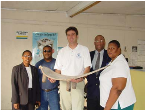
Collecting the duho in the Bahamas, 2003