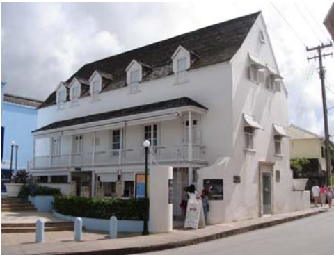
Arlington House Museum, Speightstown