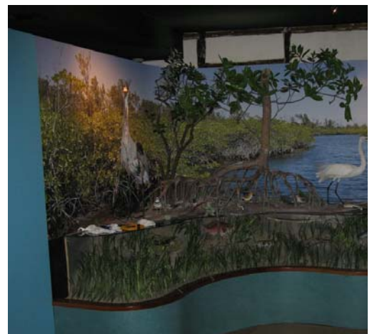
2009- Mangrove Diorama