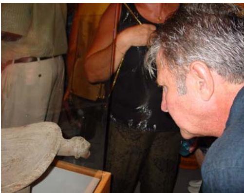
Unveiling the duho at the Turks and Caicos National Museum