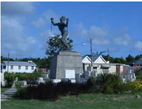
Emancipation Statue, Bridgetown