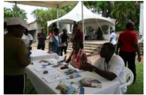
Museum Information Booth

The museum also set up a booth selling books as well as giving information about its activities, including volunteering and membership. There was music all day as two bands, 'Fuxion' and 'Molasses' from the Music Department of the Barbados Community College, gave excellent renditions, pictured below.