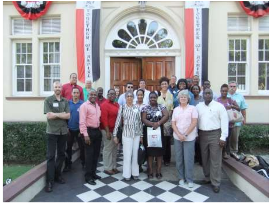
Some of the delegates at the 2012 MAC AGM in Trinidad

We would like to see more Caribbean museum professionals participating in MAC. This can be done in many ways, but three of the main ones are: