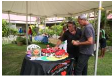
Spices from Wentrox