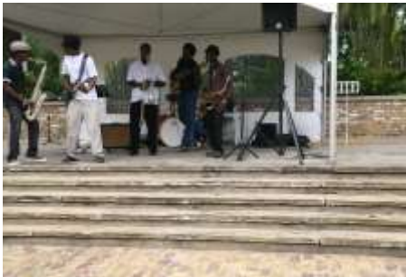
Fuxion and Molasses Band

The museum also set up a booth selling books as well as giving information about its activities, including volunteering and membership. There was music all day as two bands, 'Fuxion' and 'Molasses' from the Music Department of the Barbados Community College, gave excellent renditions, pictured below.