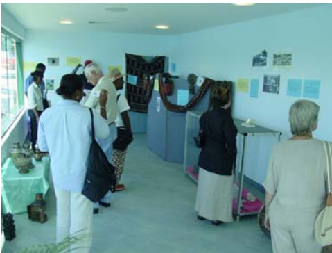
An exhibition marking the 50 th anniversary of the St Lucia National Trust. National Trusts are often responsible for archaeological work in the region.