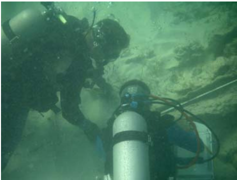
Archaeologists looking for the slave ship Trouvadore , Turks and Caicos Islands