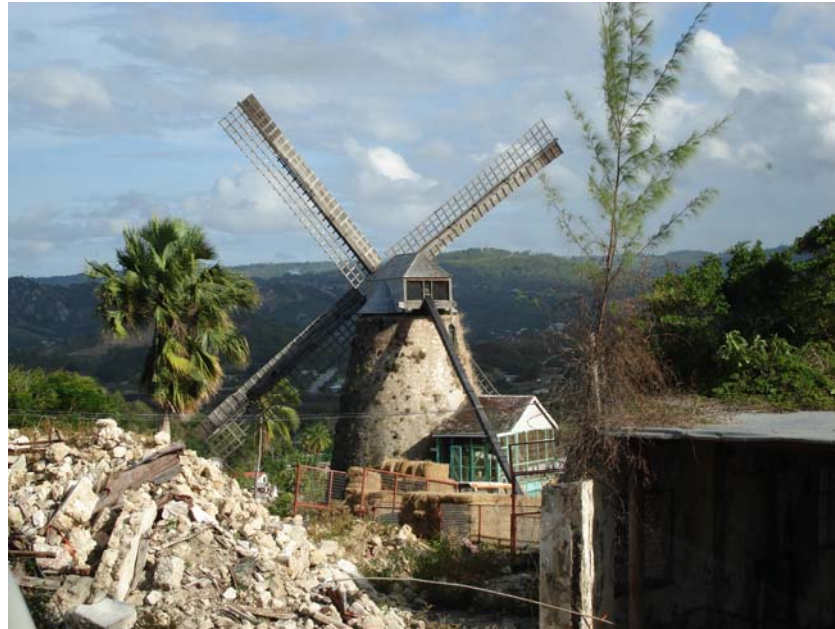
Come and explore the heritage of Barbados with MAC

MAC is an organization to help Museums and Museum professionals in the Caribbean. It relies on the membership to direct and help the elected Board who do all the work voluntarily. This is YOUR organization and the more the membership help, the more active MAC can be.