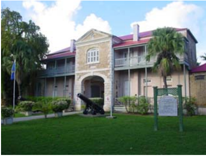
Barbados National Museum

The Barbados National Museum is located at the Garrison, and is housed in the former British Military Prison. The prison, whose upper section was built in 1817 and lower section in 1853, became the headquarters of the Barbados Museum and Historical Society in 1930.