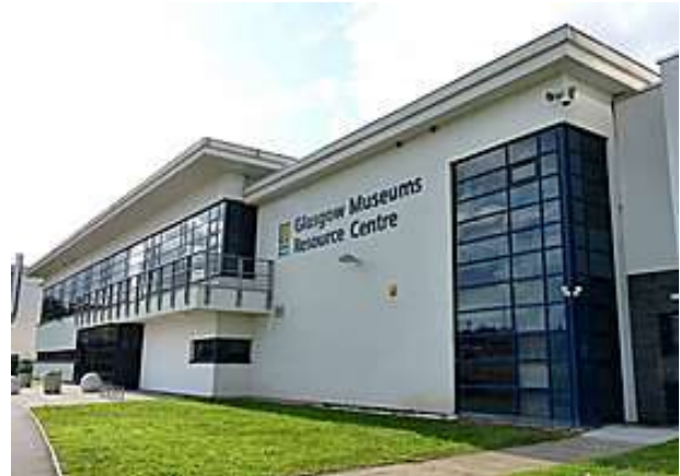
Glasgow Museums Resource Centre

May 14-15: International symposium May 16: Visits to Community Outreach Programs & Glasgow Museum Tours May 17: Invitational Workshop on Museums & Participatory Governance, limited to 30 delegates