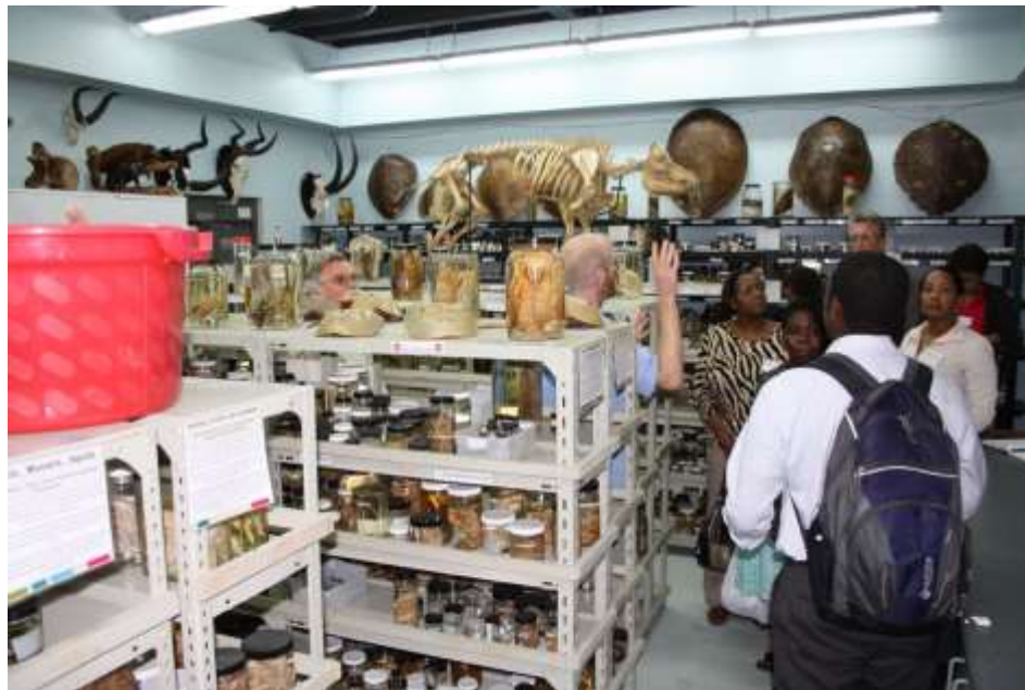
Host of the 2012 MAC AGM in Trinidad showing some delegates around their collection

Wow, what a wonderful year this is for meetings and training opportunities for museums in the Caribbean. As this issue reports we not only have our own MAC AGM in Belize in October, but there are events in the Bahamas, Puerto Rico, Argentina and of course the ICOM meeting in Brazil, which will hopefully attract several thousand museum professionals including many from the Caribbean region. On top of this there are specific subject meetings that relate to museum collections in the region, most notably the International Association of Caribbean Archaeology (IACA) which held their meeting in July in Puerto Rico. If you know of any other meetings going on in the region or that will benefit Caribbean museums, please tell us.